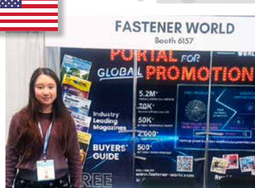
METALCON 2025 10/21-23 Las Vegas Convention Center