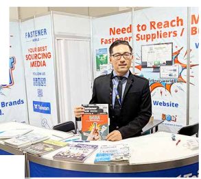
Fastener Poland 2025 10/15-16 Expo Krakow