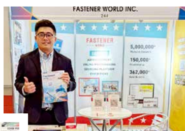
Fastener Fair USA 2025 05/28-29 Music City Center