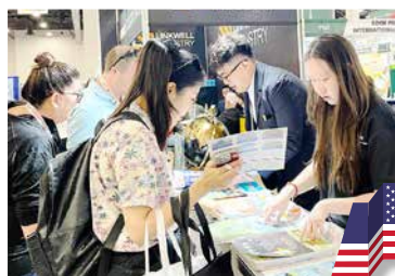
International Fastener Expo 2025 09/16-17 Mandalay Bay Convention Center