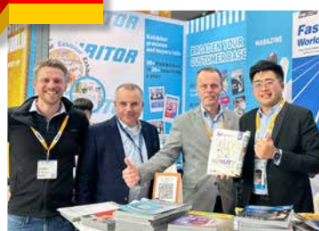
Fastener Fair Global 2025 03/25-27 Messe Stuttgart