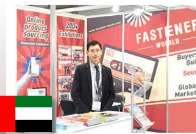
SteelFab 2025 01/13-16 Expo Centre Sharjah