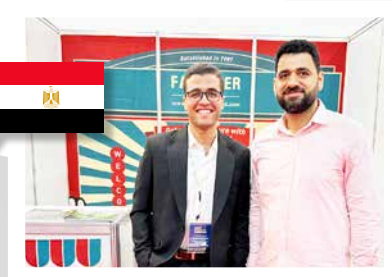
Egypt Projects 2025 09/06-08 Egypt International Exhibition Center