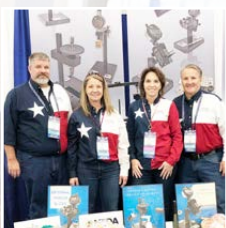
Greenslade & Company