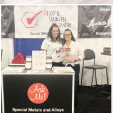
Alloy & Stainless Fasteners