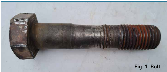
Fig. 1. Bolt

Apart from some people kicking it, nothing happened at all. No one stopped to wonder what the screw was doing there, how it got there, and why it came loose. Everyone was hurrying about their business. No one realized that a screw as such can also serve as a valuable study material.