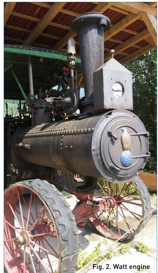
Fig. 2. Watt engine

“In practice, bolts are the most widely used machine components. The use of bolted joints is very versatile. A failure of the bolted joint could cause serious consequences. Therefore, proper design, dimensioning and subsequent assembly of bolted joints is of great importance. In industrial practice, however, the importance of bolted joints is very often underestimated and bolts are only used according to “feel”.